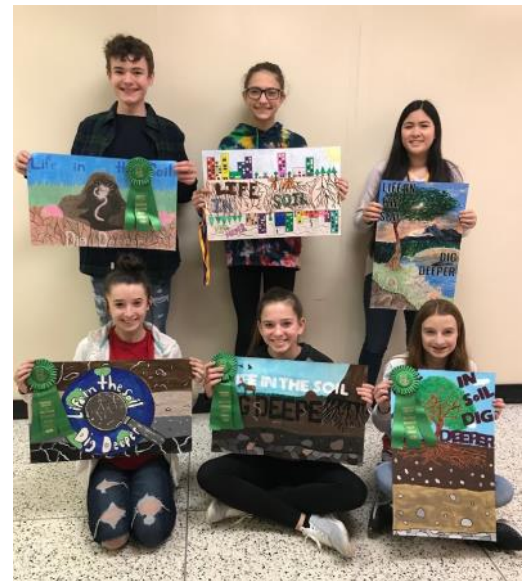
McDowell 7th & 8th Graders