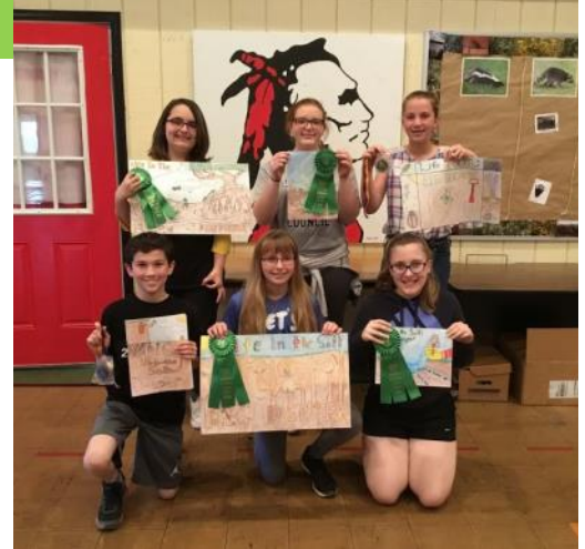
Salt Creek 6th Graders