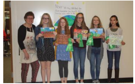
McDowell Middle School Winners